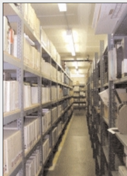
Fig. 5. Vault at Grateful Dead Productions.