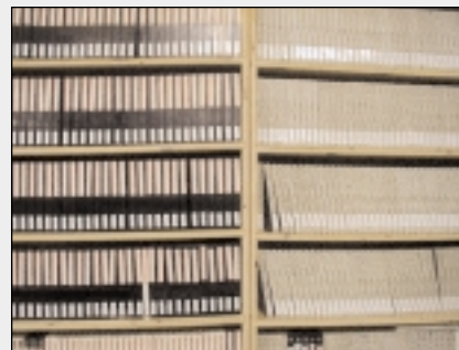
Fig. 2. Early vault at Grateful Dead Productions.

sticky residue. The end result is that the tape is unplayable.