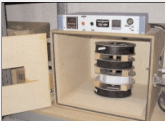
Fig. 4. Tapes inside convection oven at Grateful Dead Productions.