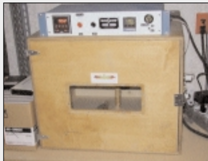
Fig. 3. Convection oven used for “baking” at Grateful Dead Productions.

Jeffrey Norman at Grateful Dead Productions (GDP) used the recommenda-